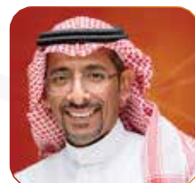
HE Bandar Alkhorayef Minister of Industry and Mineral Resources Kingdom of Saudi Arabia