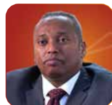
HE Yonis Ali Guedi Minister of Energy and Natural Resources Republic of Djibouti