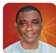
Hon. George Mireku Duker Deputy Minister of Lands and Natural Resources Republic of Ghana