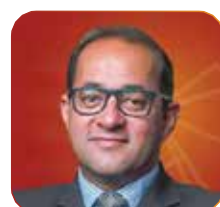
HE Ahmed Kouchouk Minister of Finance Arab Republic of Egypt