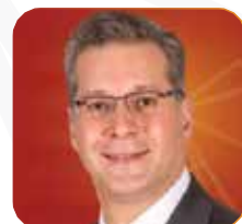
HE Karim Badawi Minister of Petroleum and Mineral Resources Arab Republic of Egypt