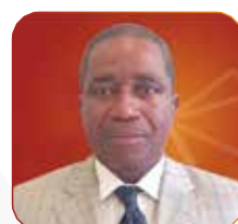
HE Domingo Mba Esono Vice Minister of Mines & Hydrocarbons Republic of Equatorial Guinea