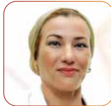
HE Dr. Yasmine Fouad Minister of Environment Arab Republic of Egypt