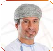
HE Salim Al Aufi Minister of Energy and Minerals Sultanate of Oman