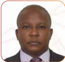
HE Dr. Polite Kambamura Deputy Minister of Mines and Mining Development Republic of Zimbabwe