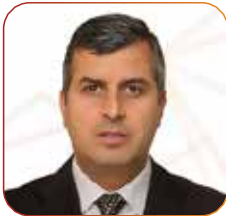
HE Dr. Saleh Al-Kharabsheh Minister of Energy and Mineral Resources Hashemite Kingdom of Jordan