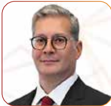
HE Eng Karim Badawi Minister of Petroleum and Mineral Resources Arab Republic of Egypt