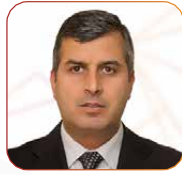
HE Dr. Saleh Al-Kharabsheh Minister of Energy and Mineral Resources Hashemite Kingdom of Jordan